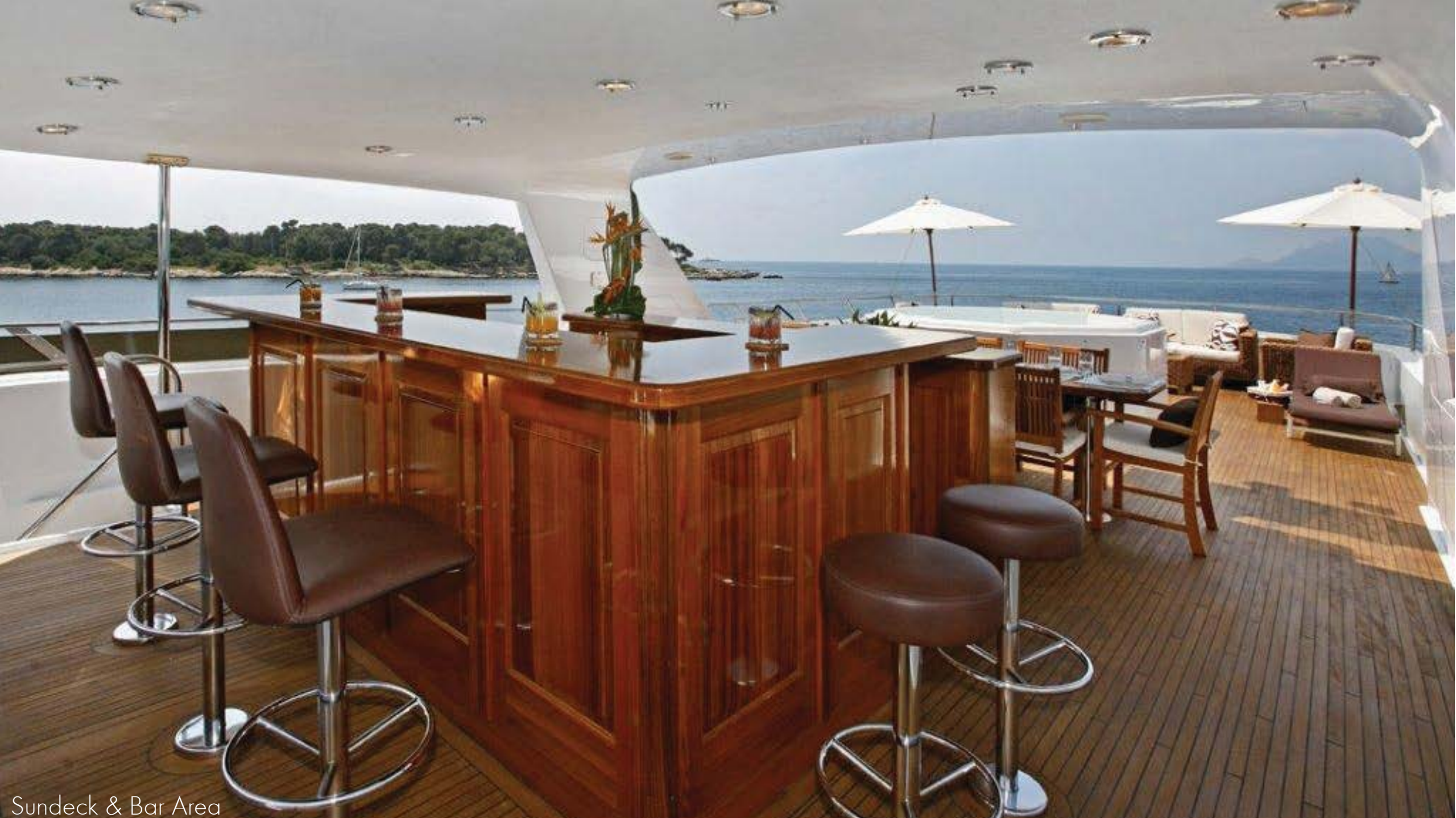
Sundeck & Bar Area