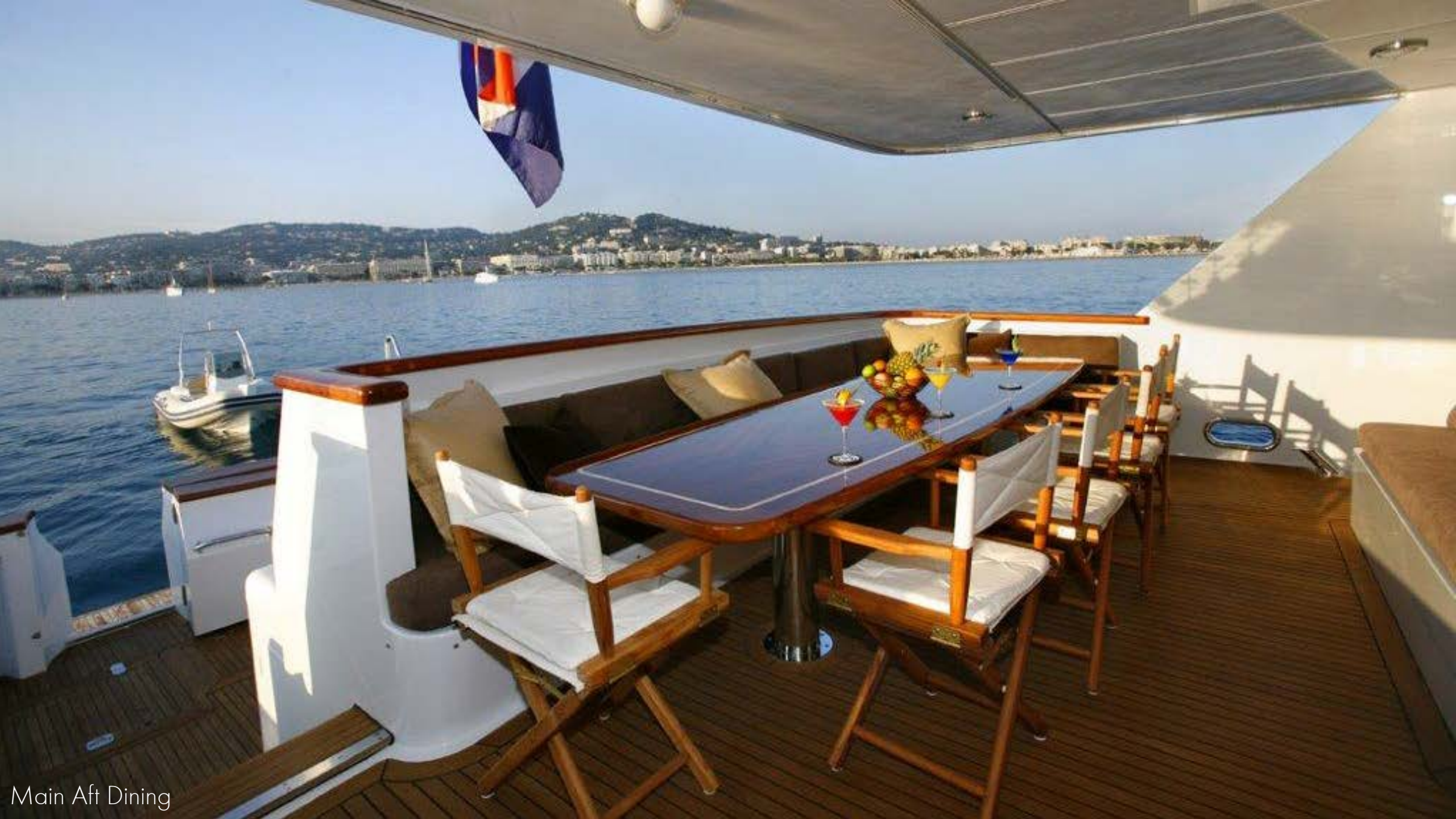
Main Aft Dining