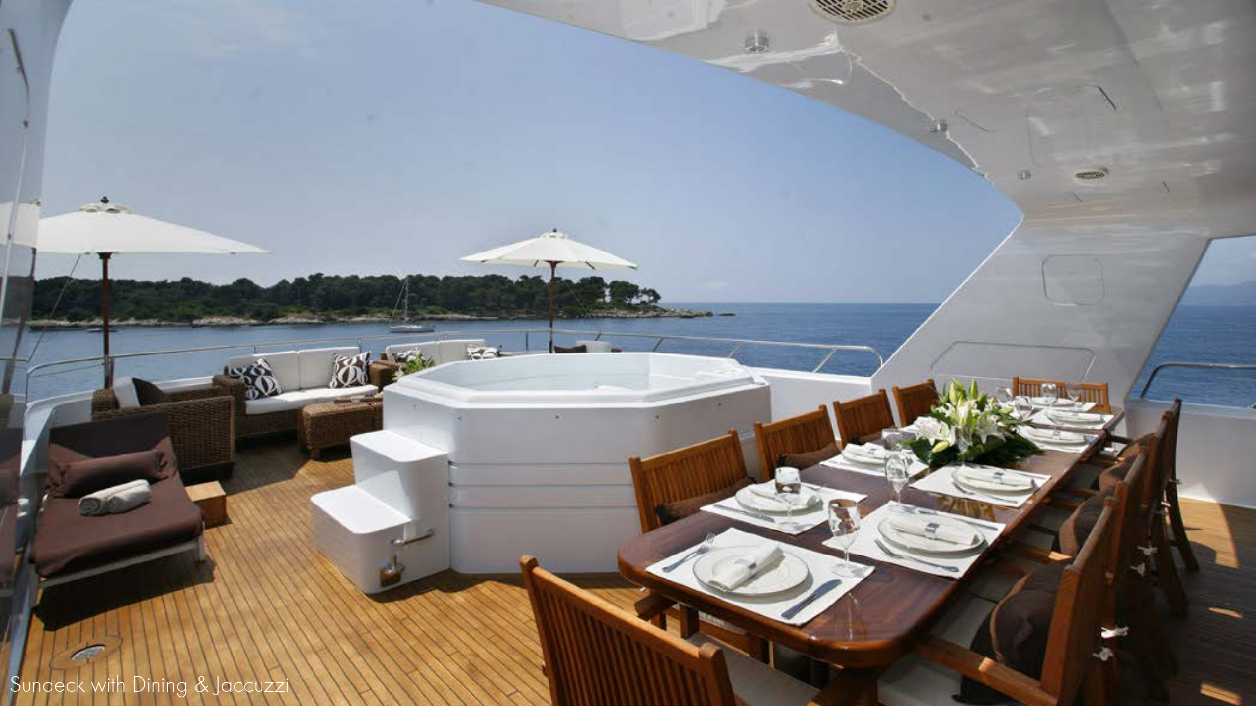
Sundeck with Dining & Jacuzzi